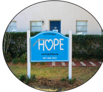
HOPE's Resource Center