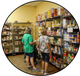
Choice Food Pantry